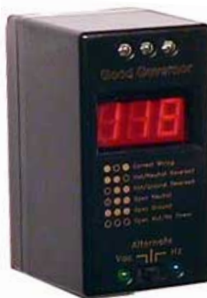
Figure 2—Prized by RVers, PowerWatch Technologies' Good Governor is a handy unit that visually indicates ac wiring faults and accurately displays the voltage and frequency of the ac line source it's plugged into. If you can't find one at your local RV dealership, contact the manufacturer at PO Box 22988, Denver, CO 80222.

As previously mentioned, voltage and frequency regulation—or lack thereof—may significantly influence your buying decision. The bottom line is that any PPG can safely power lightbulbs, heating elements and power saws, but when it comes to computers, TVs and expensive ham radios, units with mechanical or electronic regula-