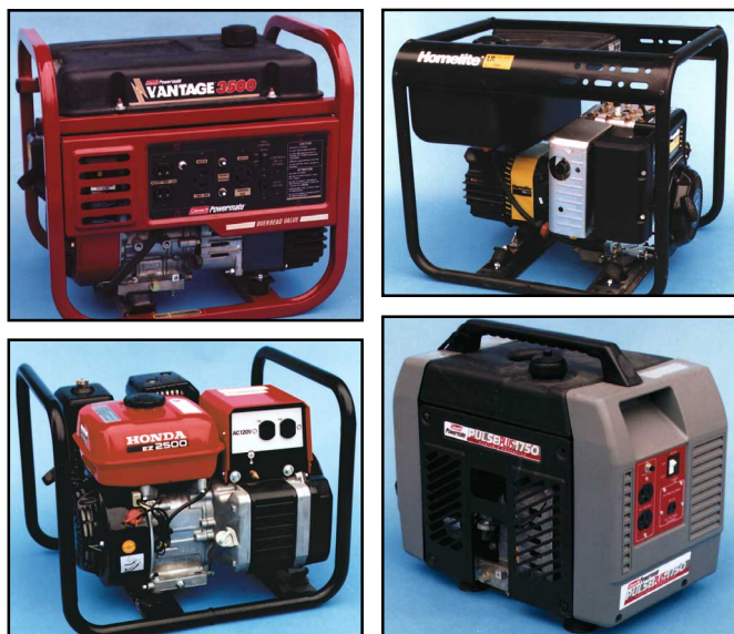
Figure 1 —The author tested these four portable power generators during the creation of this article. See Table 1 and the " Resources " sidebar for more information.

PPG size and weight usually vary according to power output—